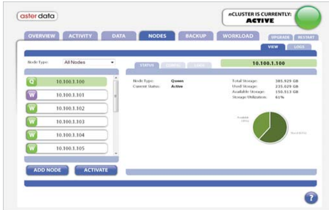
Figure 2: Intuitive browser-based system administration.